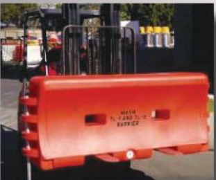
Water-Cable Barrier can be easily lifted and placed using a forklift or pallet jack