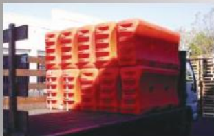
Water-Cable Barrier stacks for storage and transportation

Water-Cable Barrier to be 72" (1.9 m) long x 18" (0.46 m) wide x 32" (0.8 m) tall and molded from polyethylene. Water-Cable Barrier to be MASH tested, passed and eligible for TL-1 31 mph (50 km/hr) and TL-2 43.5 mph (70 km/hr) barrier applications. Individual wall shall weigh 100 lbs (45.4 kg) including internal cables empty and 1,070 lbs. (485.3 kg) when filled. Three 3/8" diameter stranded steel cables are molded into the wall to contain the impacting vehicle during an accident. Standard colors are orange/red and white, product may also be produced in other colors. Water-Cable Barrier modules are connected together with galvanized steel T-pins passing through a double wall knuckle which minimizes breakage at hinge points. Water-Cable Barrier shall pivot up to 30 degrees when connected. Water-Cable Barrier to have one 8 in (203 mm) diameter fill hole for quick filling and a twist lock cap for closure. Water-Cable Barrier will have molded fork lift slots to provide easy movement. Drain plug to be centered on the modules to protect against cracking or breaking and have coarse buttress threads for quick removal and insertion. Water-Cable Barriers shall stack for easy movement and storage.