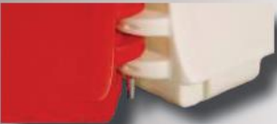
Water-Cable Barrier can pivot 30-degrees and be locked together with steel connection pins