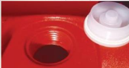
Tamper resistant, offset drain plug with coarse buttress thread