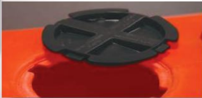
Large 8" fill hole speeds filling process, includes twist-lock plastic cap